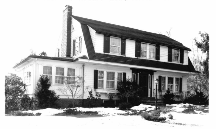
38961 28 EUCLID AVE, MAPLWD B

Board of Realtors of the Oranges and Maplewood